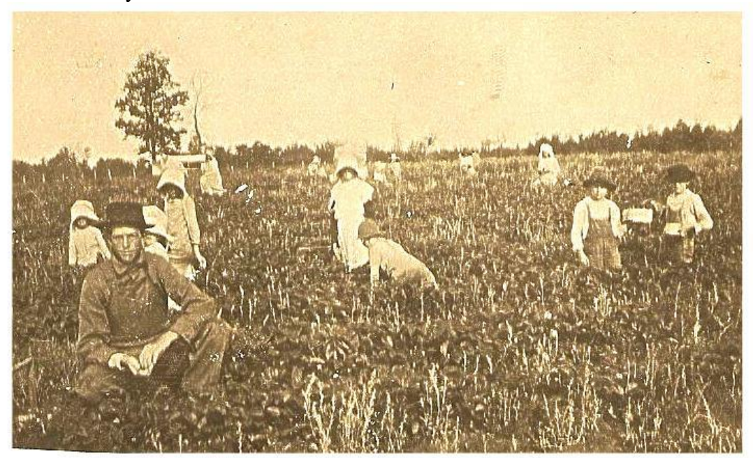
Figure 1 . The Kings' strawberry field in Tenaha, TX in the early 1920s.

propagator and preferred the solitude of plant production to the often-hectic nature of retail sales (Fig. 3).